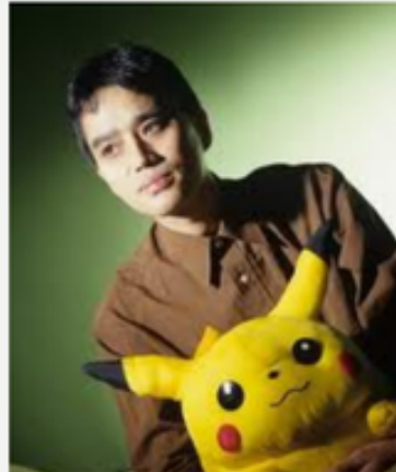
Satoshi Tajiri Creator of Pokémon